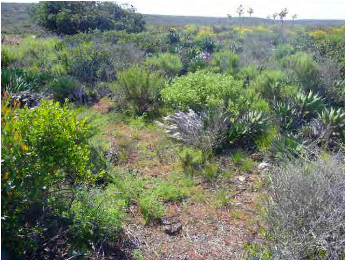
Figure 8. Prehistoric groups used native plants such as Agave shawii, jojoba, and chia, among many others.