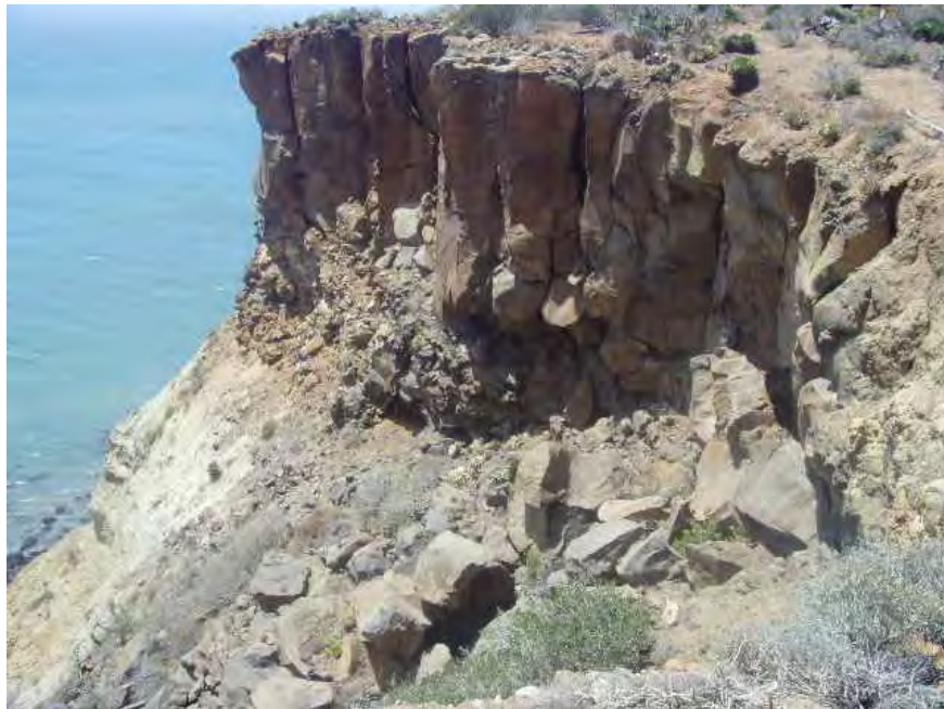
Figure 3. Punta Colonet, basaltic mesa's cliff.