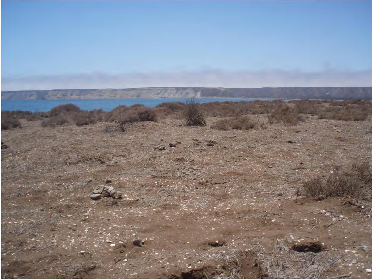
Figure 2. Colonet Bay with Punta Colonet in the background.