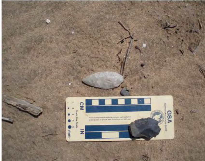
Figure.7 In situ projectile point of foliaceous shape, made of quartz.