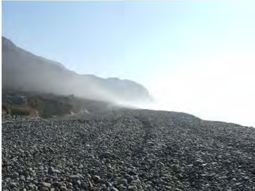
Figure 4. Basaltic pebbles and cobbles down on the beach.