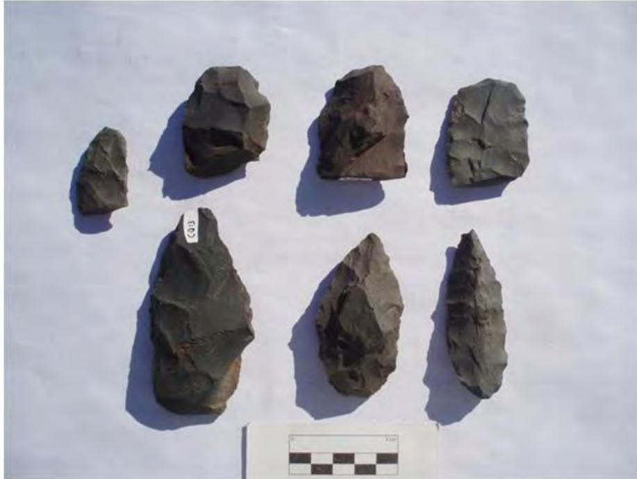
Figure 6. Preforms of knives made of fine-grained basalt.

the seasons when humans were absent and busy collecting seeds in the intermountain region.