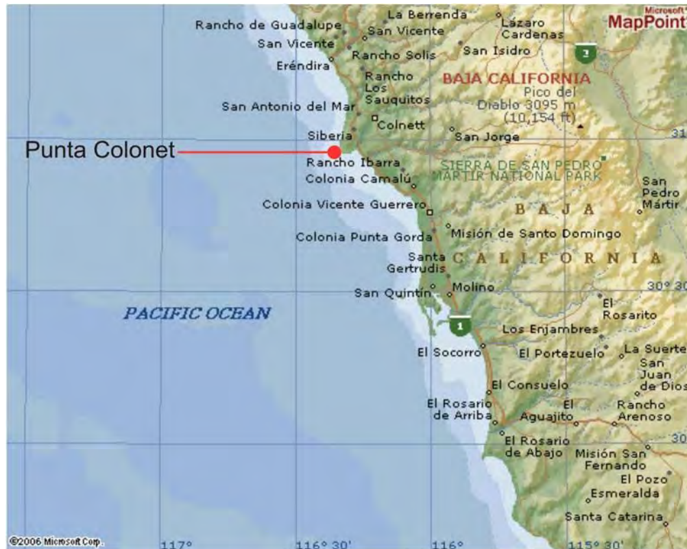
Figure 1. Punta Colonet in northwest Baja California.