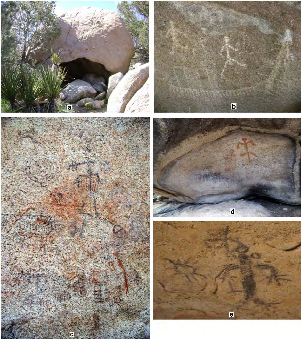
Figure 2. Examples of La Rumorosa rock art: a and b, Los Guerreros site; c and d, Las Pilitas site; e, El Vallecito site.