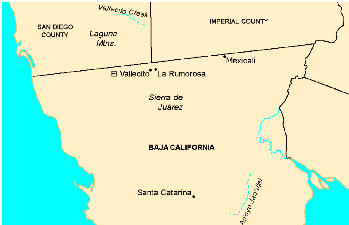
Figure 1. Map of the region of La Rumorosa rock art.

The main vegetation is chaparral and coniferous forests. The chaparral can reach 3 m in height and is composed mainly of chamise ( Adenostoma fasciculatum ), red shank ( A. sparsifolium ), oak ( Quercus dumonii ), and juniper ( Juniperus californica ). The pine forest contains Pinus monophylla , P. quadrifolia , P. monophylla , and P. jeffreyi .