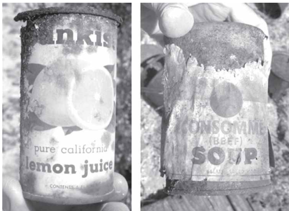
Figure 2: Examples of can preservation at CA-RIV-7959H.

within our preservation Zone B, where we would expect moderate deterioration of materials. Table 1 indicates moderate alkalinity and salinity. The site covers perhaps five acres, but the northern portion is paved over and yet to be defined. We had the opportunity to sample the deposit when the southern tip, comprising perhaps ten percent of the site, was removed because of compaction concerns pertaining to a housing development.