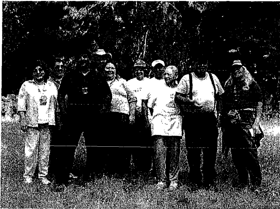
Left: Nor Rel-Muk tribal training participants and instructors.