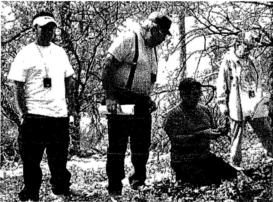
Left: Nor Rel-Muk tribal members on a site visit.